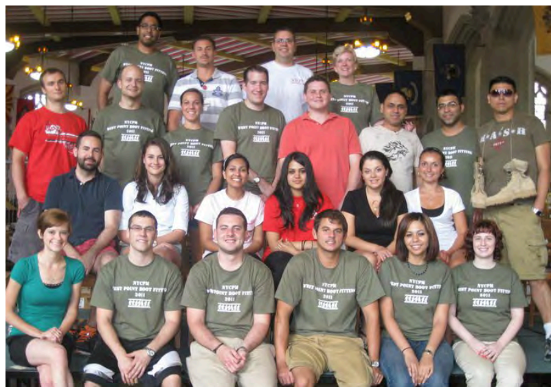
NYCPM Team 2011.