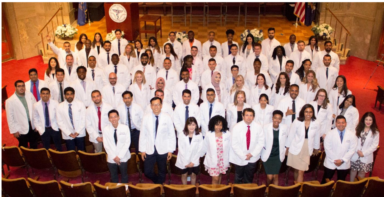
The annual White Coat Ceremony symbolizes lifelong commitment to serving the health care needs of patients.