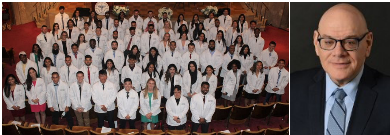
Left: Class of 2024