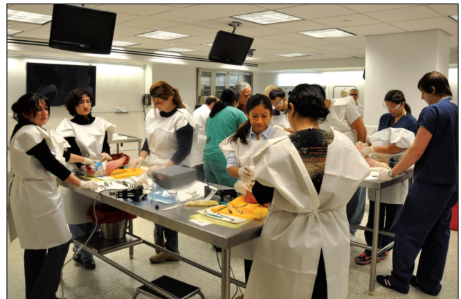
Figure 4: The Bako Pathology Anatomy Lab

Once the law was passed, they decided to form an organization. The