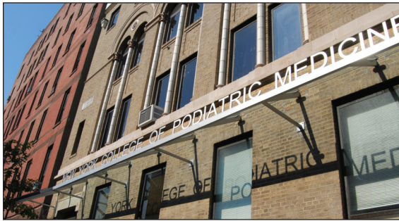
Figure 3: NYCPM today